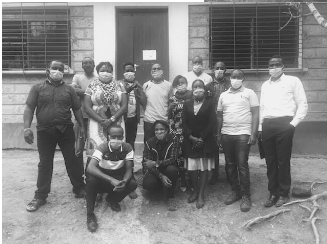
Our August rescue group (above) and our ever-growing staff (left)